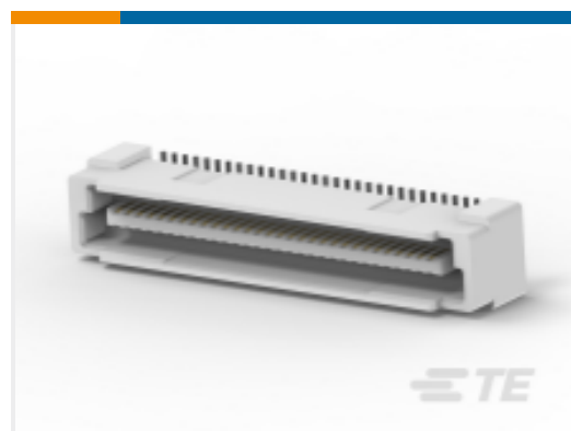
TE Part # CAT-313-PCB60 Free Height Plug Connector: Board-Board, Vertical, 60, 0.8mm