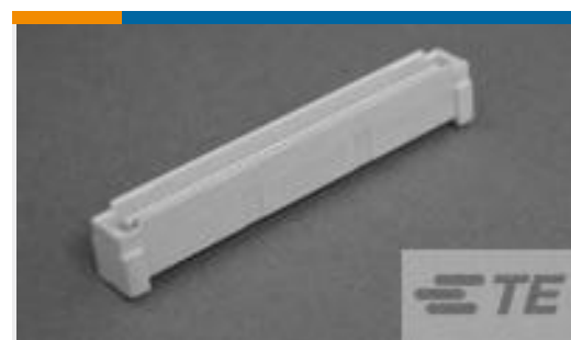
TE Part # 6123001-2 0.8FH,P08H.5,060,30/Sn,TR,SC