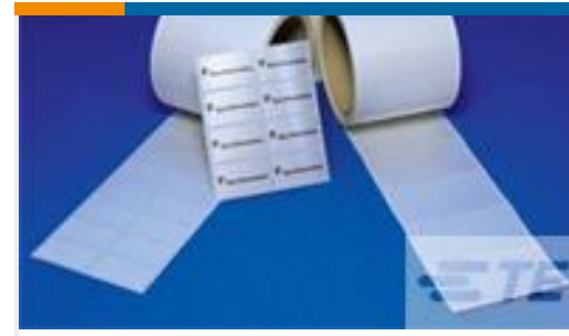
TE Part #4-1768018-3 EET-1325P-8A