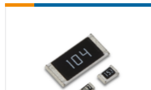
TE Part #5-2176337-6 CRGCQ.0402 390K 1%