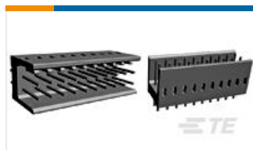
TE Part #826469-3 2X3P MOD II SHROUDED HEADER, ST