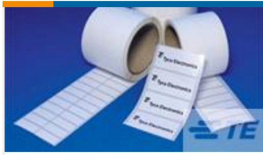
TE Part #4-1768017-2 EET-0606P-9