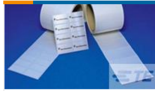
TE Part #4-1768017-7 EET-0615P-8A