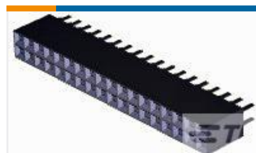
TE Part #1-534998-8 36 MODIV VRT DR CE 100/125