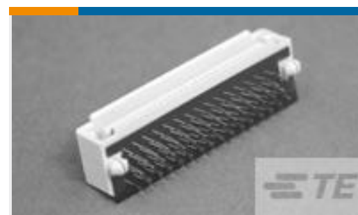
TE Part # 316229-2 0.8 FH PLUG ASSY 60P R/ANGLE