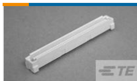
TE Part #5179029-2 0.8FH,P06H.5,060,08/Sn,TU